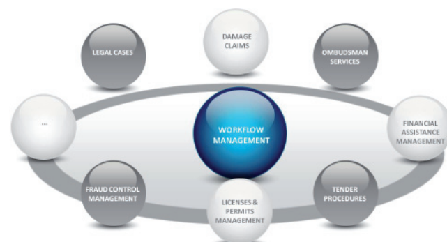
AXI [ CASE MANAGEMENT ] - overview file types

Various case dependent data can be built up dynamically per case type (complaints, tenders, subsidies, etc.) by making use of flexible fields, so-called 'flex fields'.